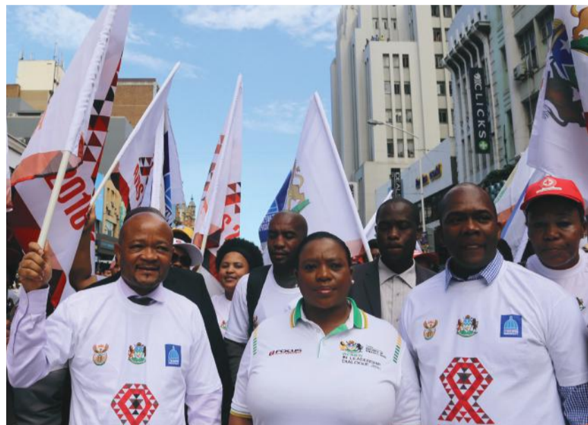
Premier Senzo Mchunu was accompanied by members of the Provincial Executive Council, eThekweni Mayor James Nxumalo, members of eThekweni Executive Committee and Councillors during the parade through the City streets. They were holding banners bearing AIDS messages.