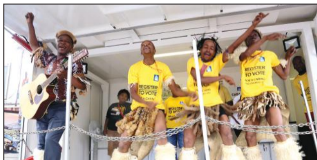
Phuzekhemisi entertains the crowd during the voter registration drive in Chatsworth.