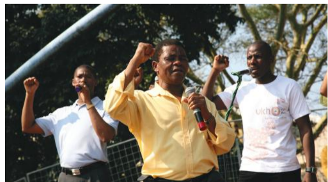
The City has identified the Creative Industry as one of the key vehicles to drive radical economic transformation. The above pictures are examples of some of the work that the Municipality supports through various programmes to develop the industry.