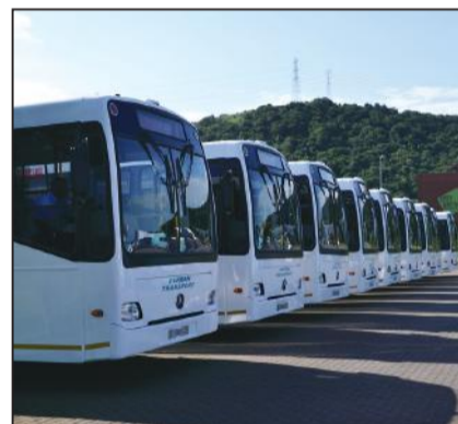
A Municipal entity, to efficiently run the Municipal bus service is expected to be established by July.