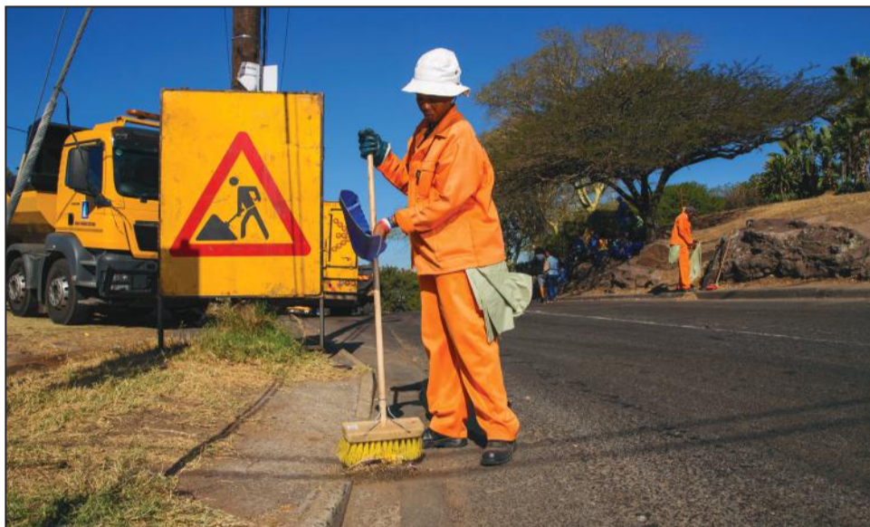
EThekwini residents are urged to comment on the draft Integrated Development Plan for the 2016/17 financial year. The closing date for public comment is 2 May 2016.

The IDP consists of eight plans that will help the City achieve its vision of becoming Africa's most caring and liveable City. These are all inter-related and include developing a prosperous, diverse