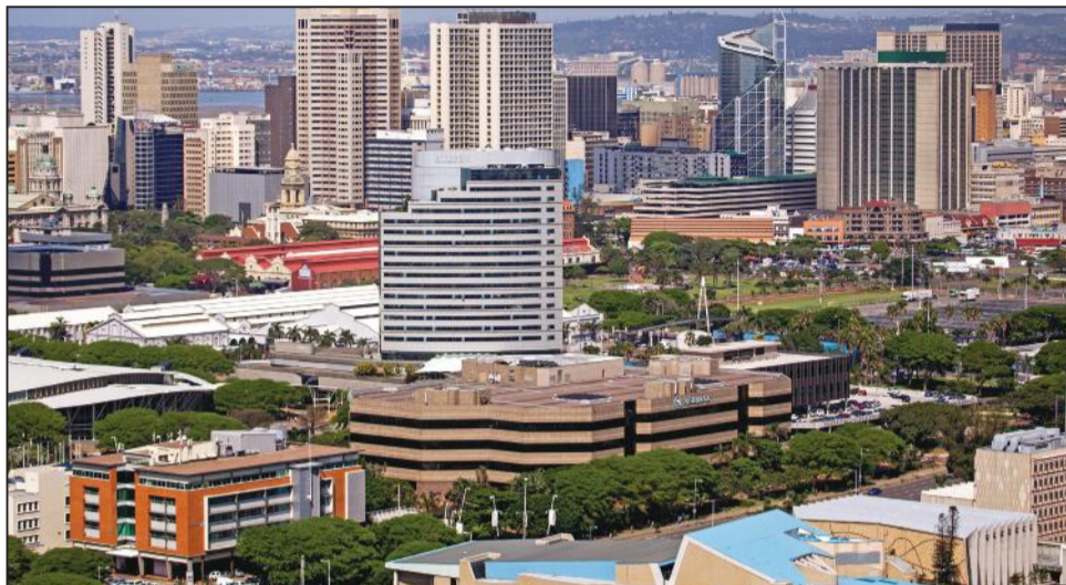
A new high-level committee has been formed with the intention of attracting investment to the City with the key focus being on big strategic projects.