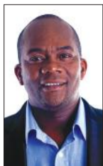
James Nxumalo eThekweni Mayor

S EVERAL by-laws have recently been implemented by eThekweni Municipality and are aimed at creating a clean and safe world-class City. Education is a very important part of by-law enforcement and the process of community engagement is on-going and we aim to incrementally change public behaviour as awareness is raised. The Nuisance and Behaviour in Public Places By-law became operational in March and provides measures to regulate and control conduct or behaviour which causes or is likely to cause discomfort or inconvenience to the public and to prevent it from occurring. Some examples of prohibited behaviour include littering and vandalism of Municipal property. Another by-law aimed at tackling social ills in Durban is the Problem Buildings By-law which aims to provide for the identification, control and rehabilitation of derelict buildings in the City. The By-law outlines steps to identify and label a building as a problem building. This includes buildings that are derelict in appearance or showing signs of becoming unhealthy, unsanitary or unsightly. Enforcement of this By-law also commenced in March. On 12 April 2016, the Beaches By-law became operational. This By-law aims to provide measures to create an effective system for