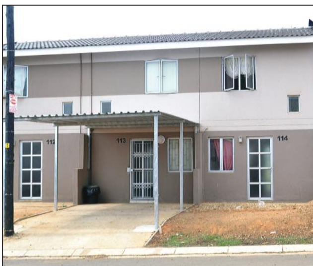
A probe into allegations that City officials are involved in the illegal sale of houses is underway.