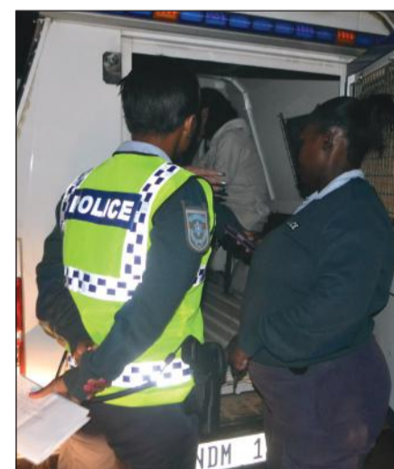
Metro Police Officers conducting law enforcement operations in the Central Business District in an effort to make the City safer.

Bhengu's comments come after two men were recently arrested in the City Centre for conning people into buying cellular phones made of polystyrene. According to police officers, the unsuspecting victims are shown a legitimate mobile phone and once payment is made the phones are swapped. The suspects have also been implicated in over-riding car