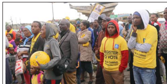
Residents of Clermont listen attentively as they are addressed by Mayor James Nxumalo about the importance of registering to vote.