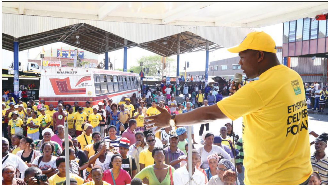
Mayor James Nxumalo urging residents to go out in their numbers and register to vote at Verulam bus terminals. He also appealed to residents to continue to save water.