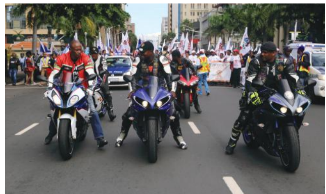
Various forms of entertainment from soulful musicians, Scottish drummers and bikers formed part of the crowd that was spreading the message of hope and an HIV/AIDS free generation.