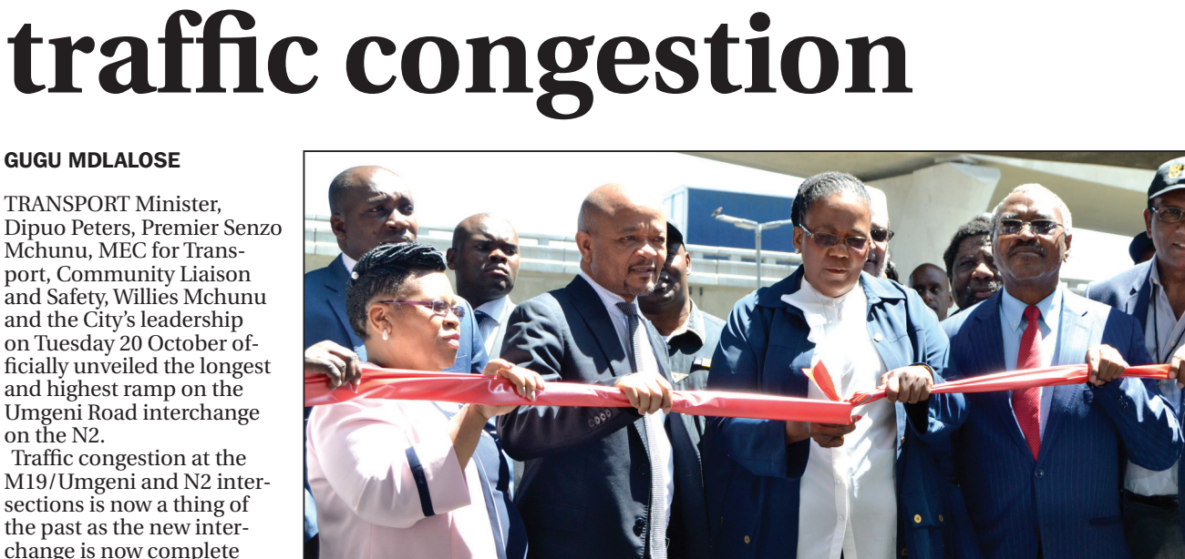
FREE FLOW: Transport Minister, Dipuo Peters (Centre) and KZN Premier Senzo Mchunu, MEC for Transport, Willies Mchunu and Deputy Mayor Nomvuzo Shabalala at the opening of the N2 interchange last week.

The R512m interchange is now allowing free flow of traffic in all directions and relieving the delays experienced in this area. The previous interchange was a conventional diamond interchange where the traffic on the ramps was controlled by traffic signals. Minister Dipuo Peters said